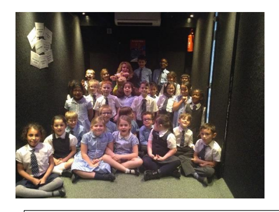
Weekly Communication Update